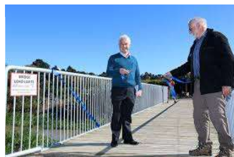
Cyclists on the track and the opening of the bridges